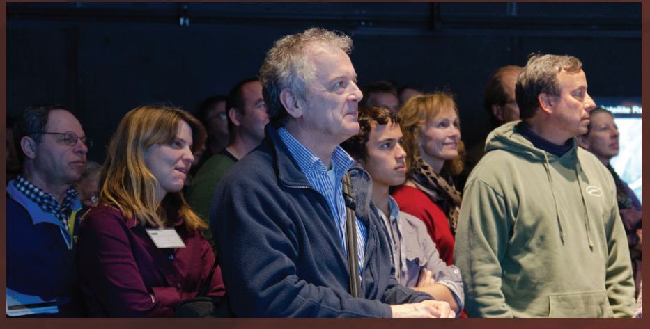
IGERT Trainees got a closeup look at the challenges of underwater archaeology when CISA2 staged its first underwater archaeology workshop February 4-7.

CISA3 Looks to the Sea for New Challenges in Cyber-Archaeology